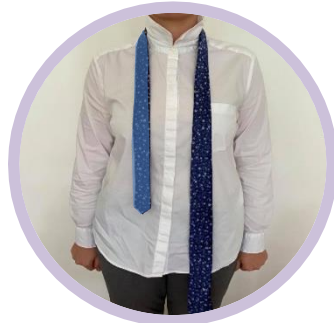
2. Place tie around your neck, making sure its not twisted