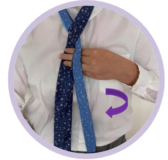
4. Then put your writing hand behind the tie and grab hold of the wide end