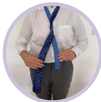
6. Continue to wrap the wide end around the narrow end until the is in the same position as before