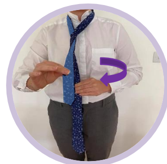
5. Wrap wide end around narrow end