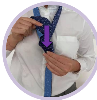
9. Slightly open the front of the knot and push the wide end down through the small opening.