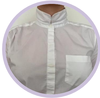
2. Start in front of a mirror Turn collar up