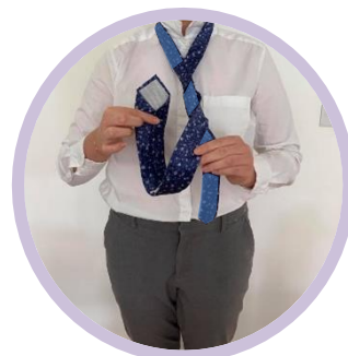
7. Bring the wide end behind the knot and pull it through the opening at your neck.