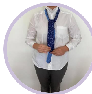
8. To look like this