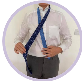
2. Whilst holding the narrow end, place the wide end over the top and let go of the wide end