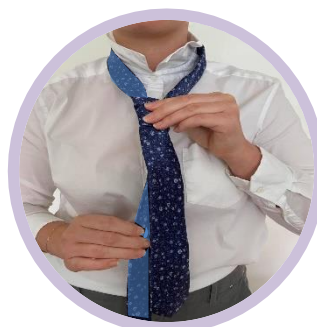
10. Slowly pull both ends down to tighten the knot. Whilst you are still holding the narrow end with one hand, use the other hand to slide the knot up using side to side movements.