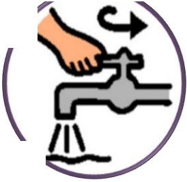
Turn on taps