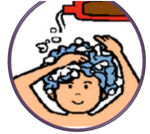
Wet hair and shampoo