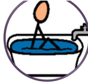
Lower gently into water