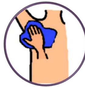
Wash both arms and armpits