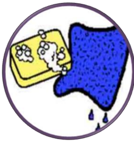
Apply soap/shower gel to cloth