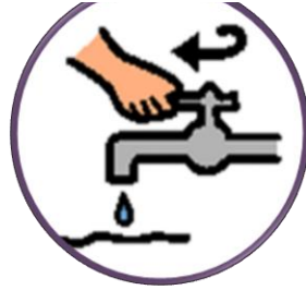
Turn off taps when bath is full