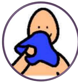
Wash face and neck