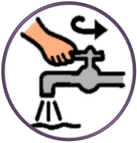
Turn on taps