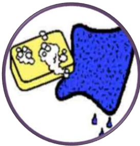
Apply soap/shower gel to cloth