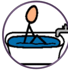
Lower gently into water