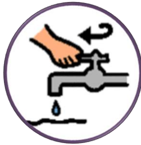
Turn off taps when bath is full