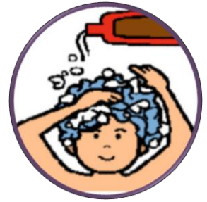
Wet hair and shampoo