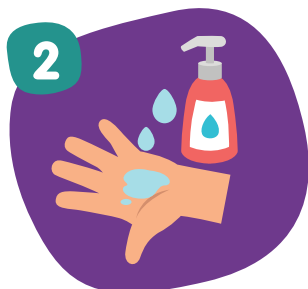
Apply enough soap to cover all hand surfaces