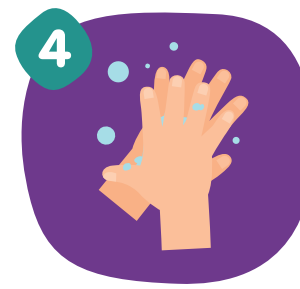
Rub back of each hand with palm of other hand with fingers interlaced