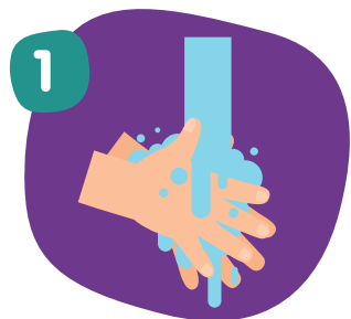
Wet hands with water

Help us stop the spread of infections. Wash your hands using the following steps: