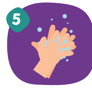
Rub palm to palm with fingers interlaced