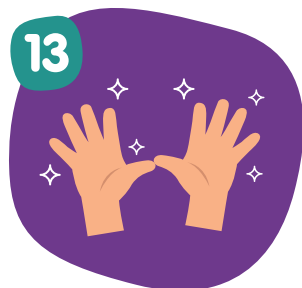
Hand washing should take 40-60 seconds