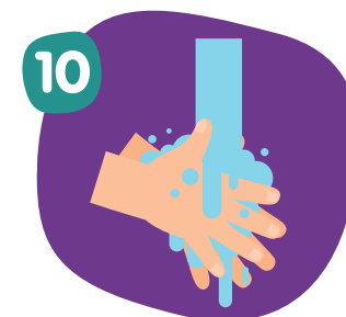
Rinse hands with water