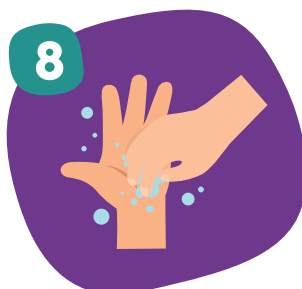
Rub tips of fingers in opposite palm in a circular motion