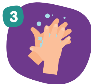
Rub hands palm to palm