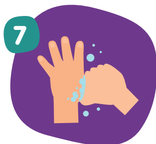
Rub each thumb clasped in opposite hand using a rotational movement