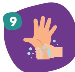
Rub each wrist with opposite hand