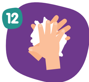
Dry thoroughly with a single-use towel